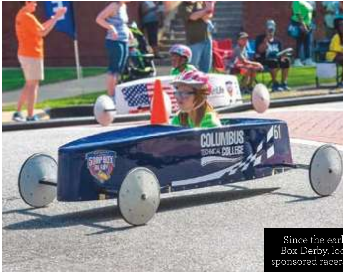
Since the early days of the Soap Box Derby, local companies have sponsored racers in the annual event.